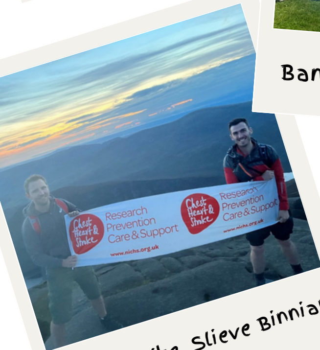
Hearty Hike, Slieve Binnian