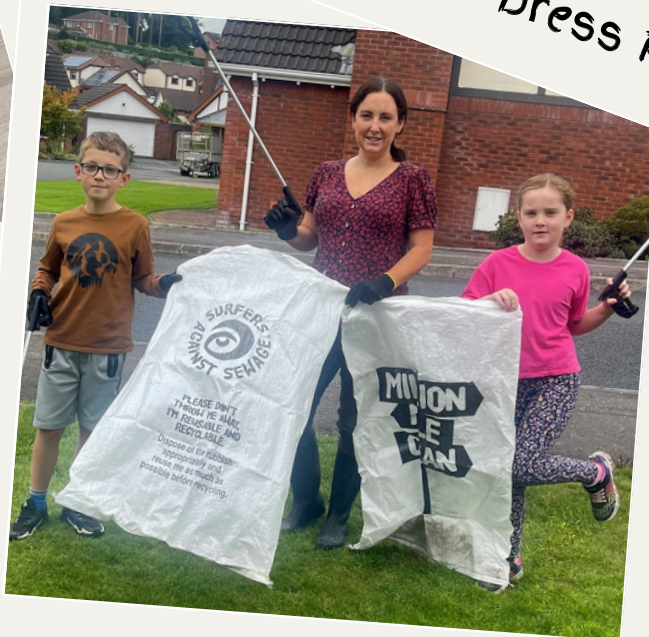
Banbridge litter picking