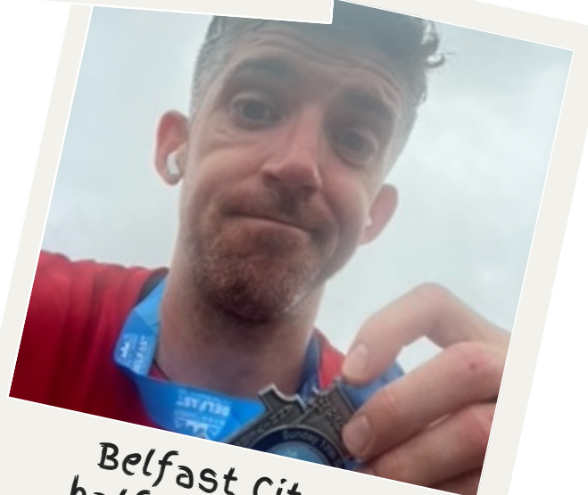
Belfast City half marathon